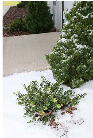
Create the perfect landscape