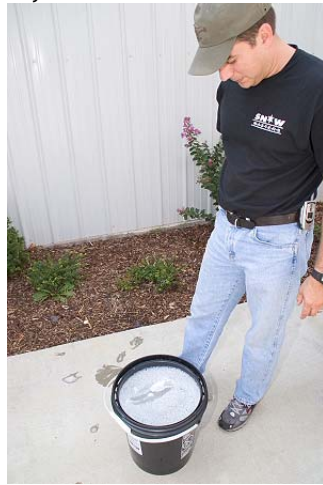
Watch the power and water combine to make snow.