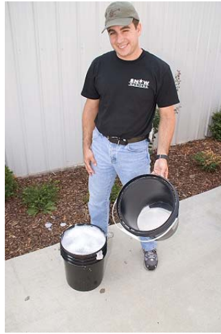
Get five gallons of water and 6 cups of faux snow