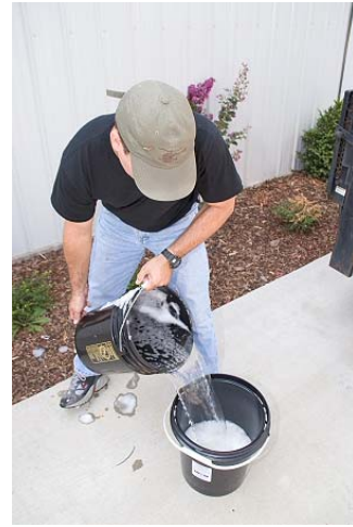
Pour the five gallons of water into the 6 cups of snow