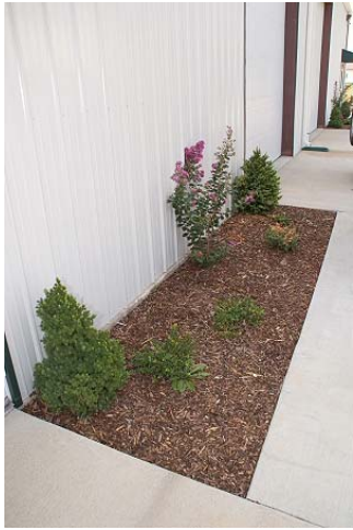
Pick the landscape that you would like to decorate