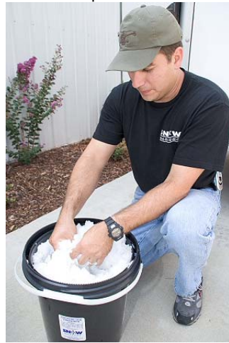
Stir the snow to be confident you have the right consistency.