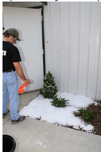
Spray with water to keep the faux snow fresh.