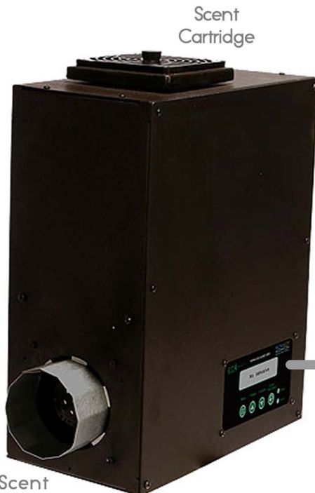
Scent to Duct